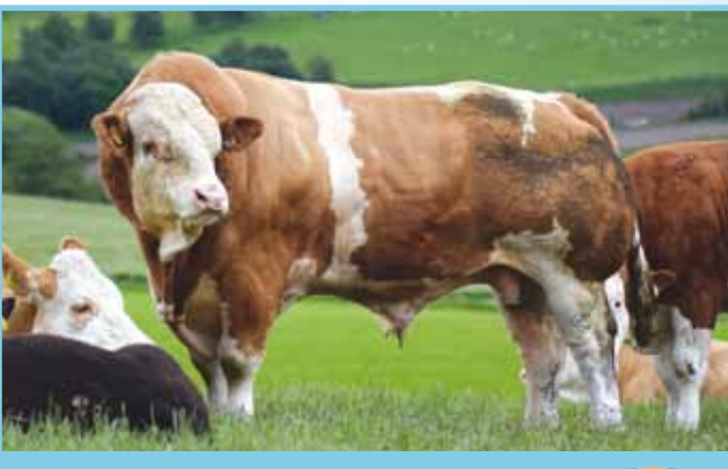
AUCHORACHAN HERCULES 16 ET S16706 Available from: