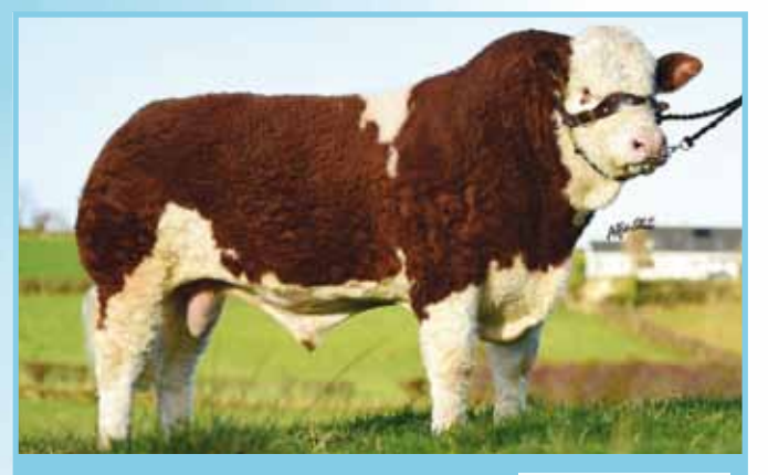
BALLINALARE FARM GALAXY 15 SI4222