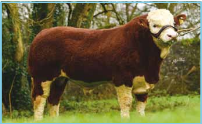
BEARNA-DHEARG HONDA 50 SI4595 Available from: