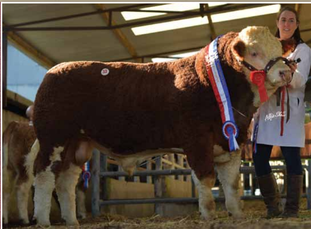
Junior Bull Champion Seaview Kango €2400