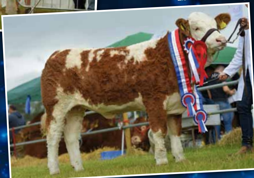
Junior Female Champion and NATIONAL Yearling Heifer Champion Lissadell Karoline ET.