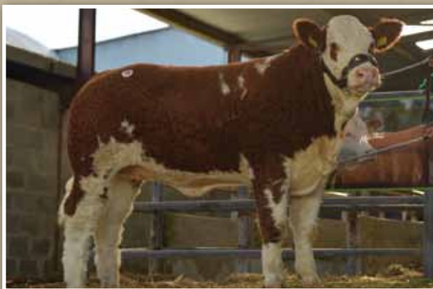
Bighill Klassy Honey Pic €6300