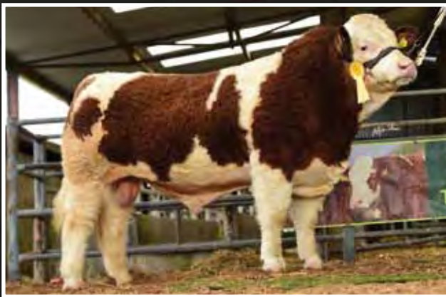
Ardunsaghan Kool Kid €2800