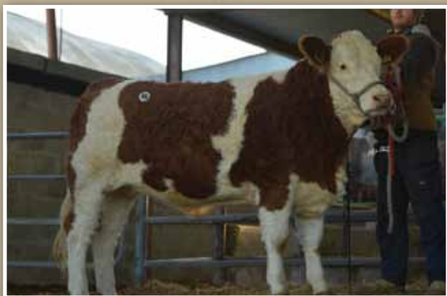
Glynwood Kandy €2500