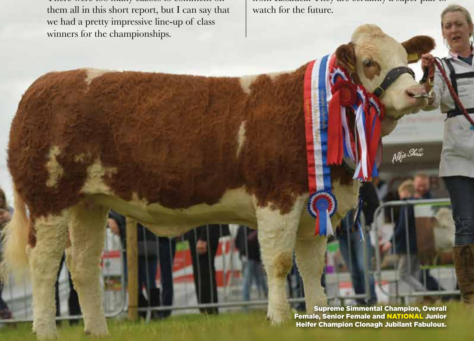
Supreme Simmental Champion, Overall Female, Senior Female and NATIONAL Junior Heifer Champion Clonagh Jubilant Fabulous.

I didn't realise it at the time, but my Junior and Reserve Junior Females were embryo sisters from Lissadell. They are certainly a super pair to watch for the future.