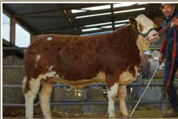
Clonagh Leix Grace €5200