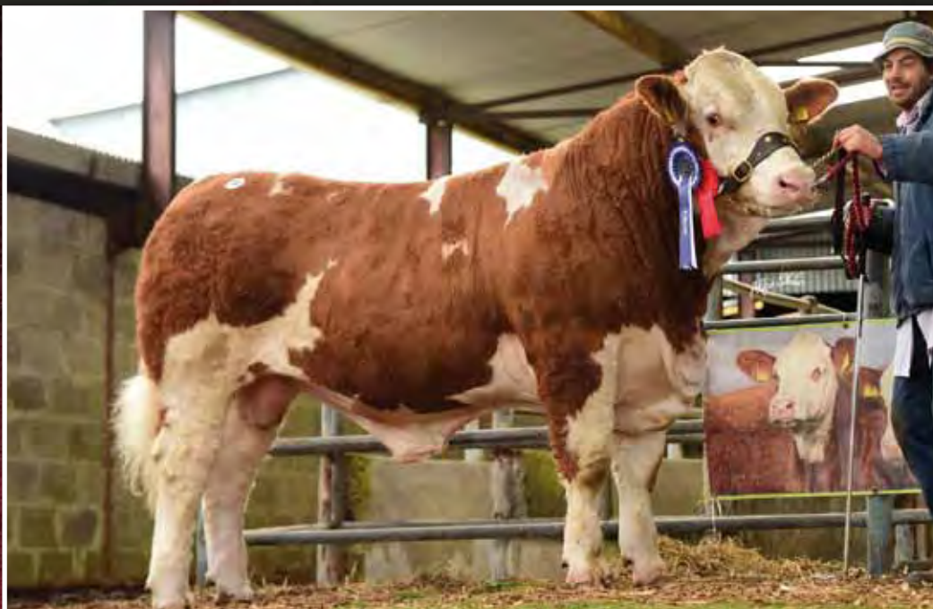
Jennalyn Kentucky Rose Reserve Junior Bull €2600