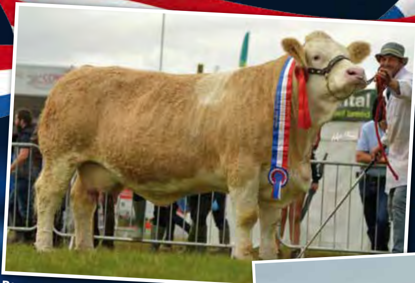
Reserve Overall Simmental, Reserve Female, Reserve Senior Female and NATIONAL Senior Cow Champion Clonagh Darling Eyes.