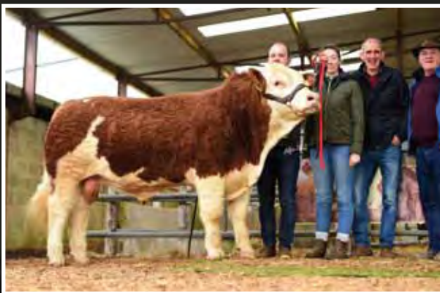
Bearna-Dhearg King €3000