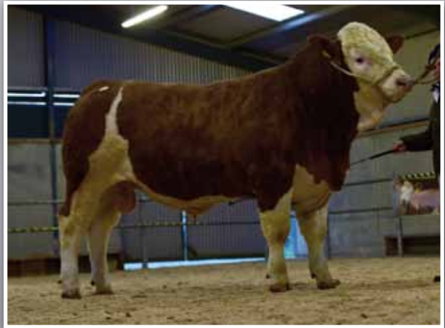
Lisnaboe Junmo €1850