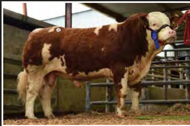
Ballykin Jacob €2400