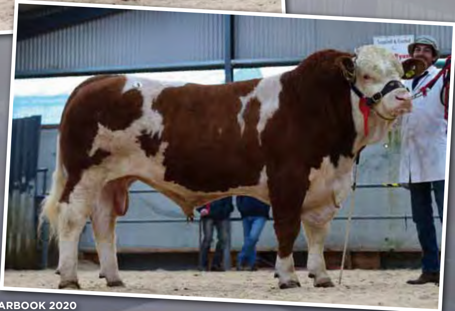
Clonagh Jungle Class €3000