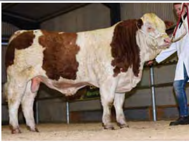
Rabawn Kenny €2050