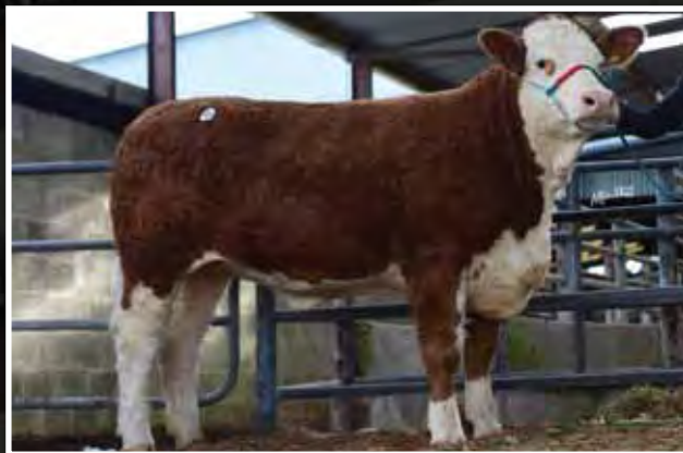
Corbally Heavenly VK ET €2800