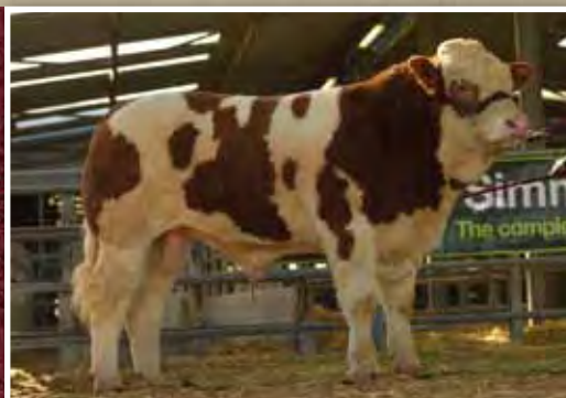
McBride farm Kracker €2700