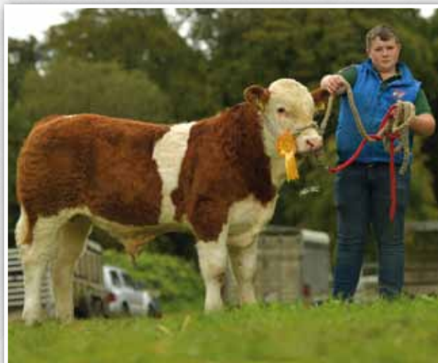
Ian Kearney pictured at Strokestown Show.