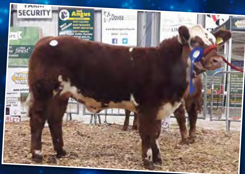
Reserve Simmental X Weanling Heifer Champion at Carrick-on-Shannon exhibited by Tom McCormack and highest priced heifer selling at €3000 for 392kgs.