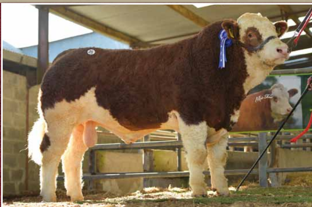
Reserve Senior Bull Champion Bearnadhearg Keith €5200.