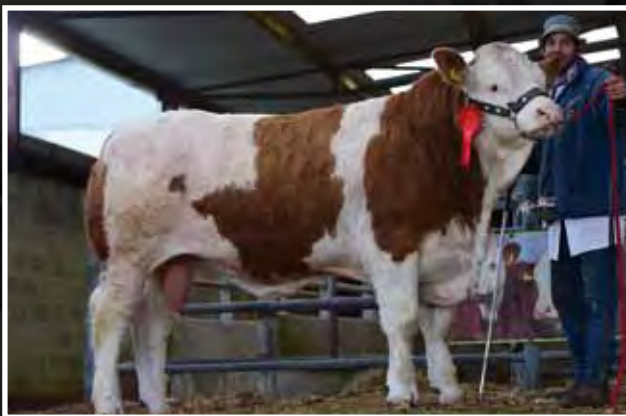
Clonagh Knockout Eyes ET €2700