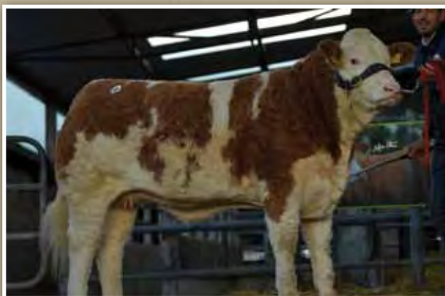
Clonagh Krystal Rubystar €10000