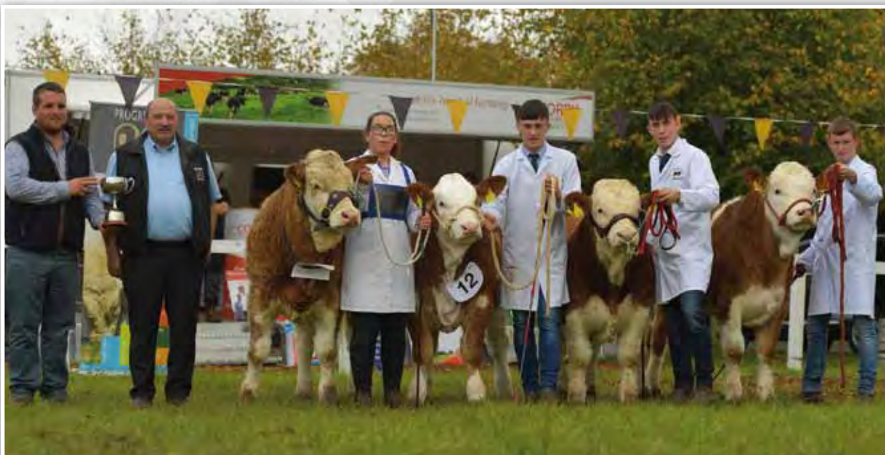
The Progressive Genetics Sponsored winners at Strokestown Show.