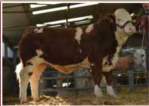
Clonagh Kracker Fab €3200