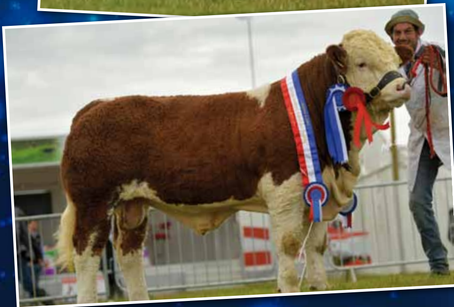
Reserve Junior Bull and NATIONAL Yearling Bull Champion Clonagh Kung Fu Fab ET.