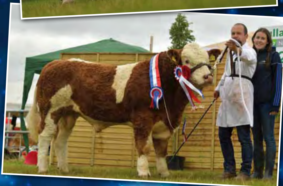
Junior Bull Champion and NATIONAL Weanling Bull Champion Bearn-Dhearg Kawasski ET.