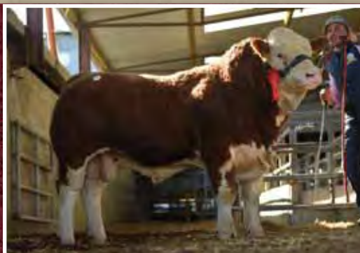
Clonagh Kaboom Kid €2900