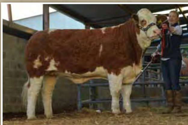
Clonagh Jubliant Fabulous €18000