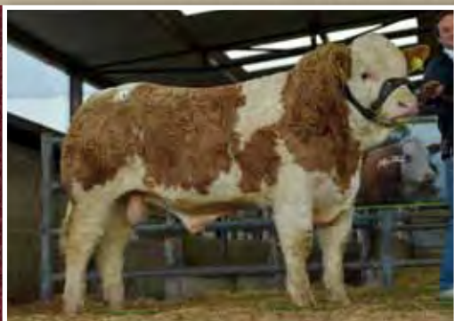
Fearnha Kungfu Jim €6300