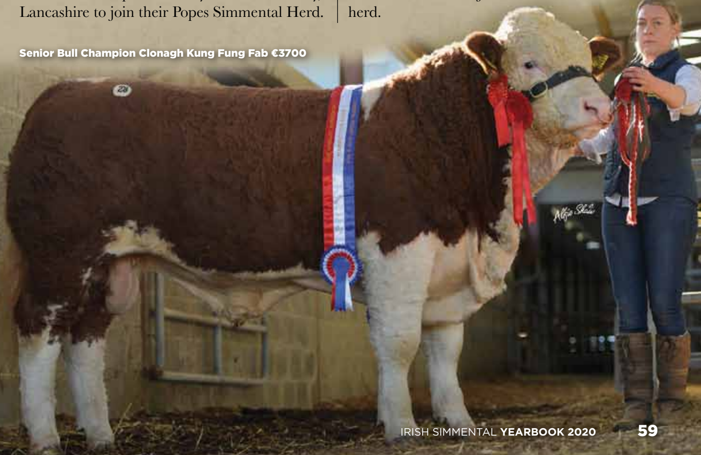
Senior Bull Champion Clonagh Kung Fung Fab €3700