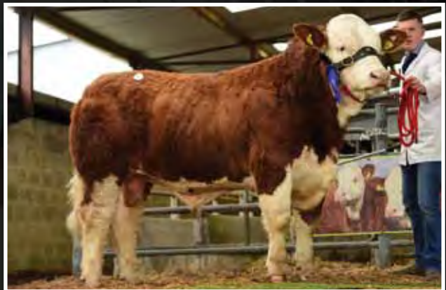
Kilkitt Jager Bomb €4100