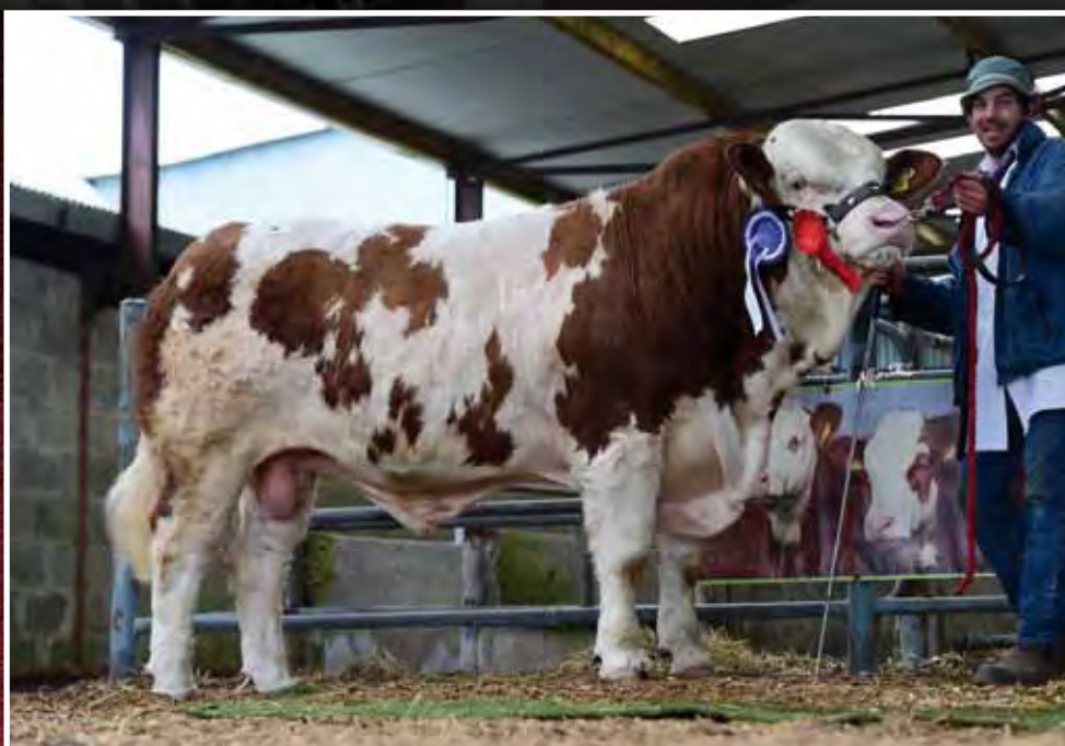
Clonagh Jims James Reserve Senior Bull €4000

This September `17 born bull was sired by Dermotstown Delboy and out of a Clonguish Cluck sired dam Broomfield Fifi. Jager Bomb joins the Kilbride Farm Herd in Co. Antrim