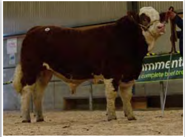
Fearna Kellstrum €2900