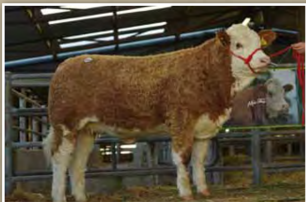
Raceview Kaltyo Ginger €3300