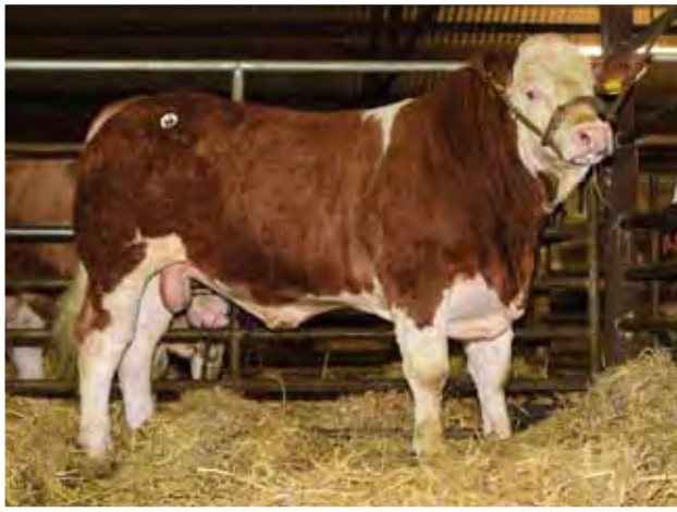
Clonagh King of The Jungle €2800