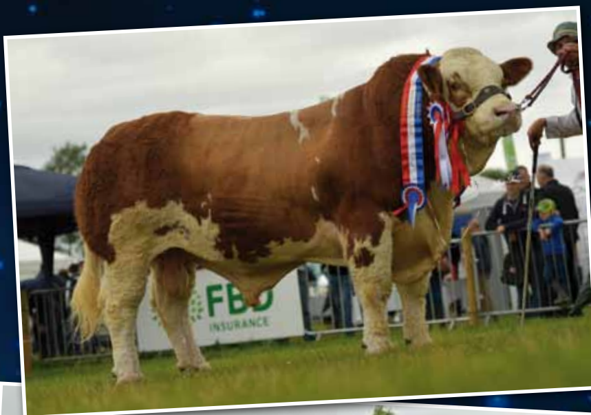
Overall Male Champion, Senior Male and NATIONAL Senior Bull Champion Manor Park Handsome.