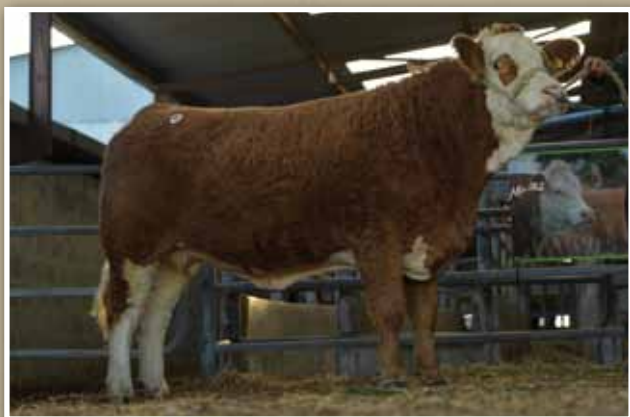
Bawnclover Jackie €2750