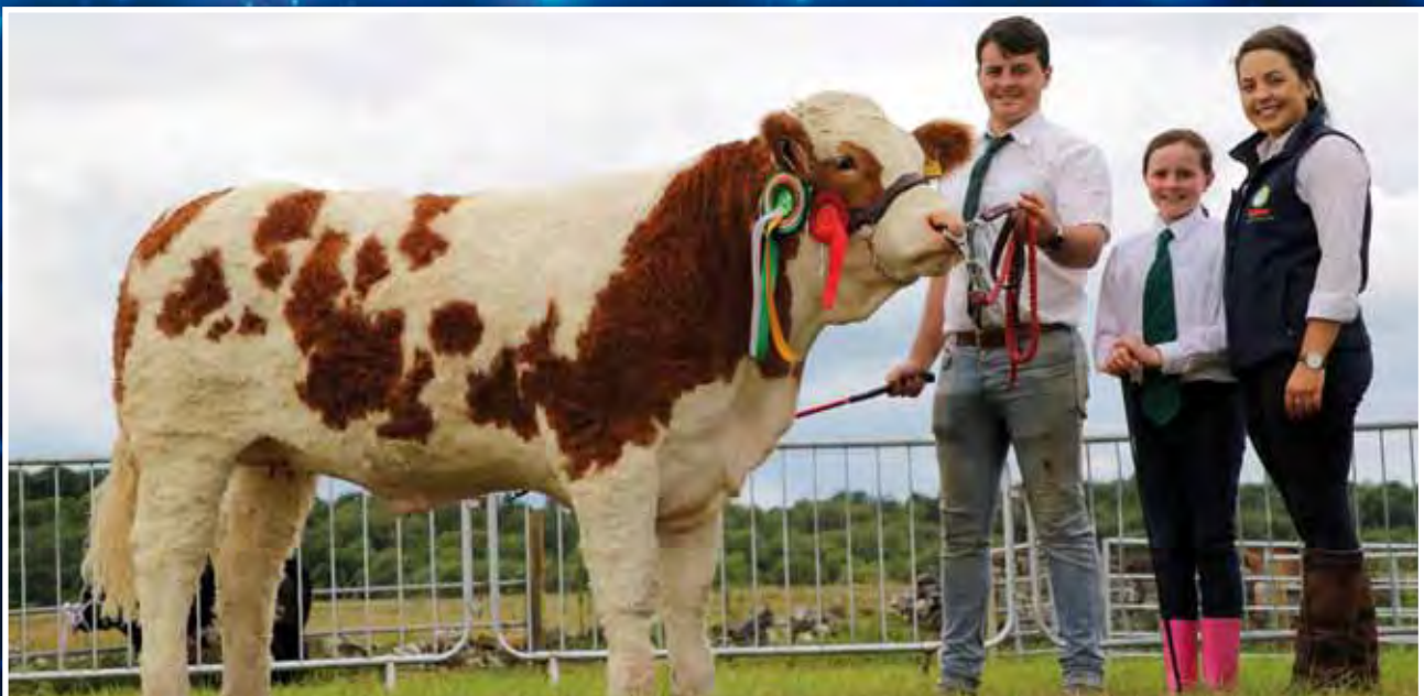
Lissadell Just The One the Overall Simmental Champion at Riverstown Show.