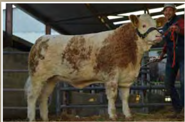
Clonagh Kyla Tilly Fi €4500