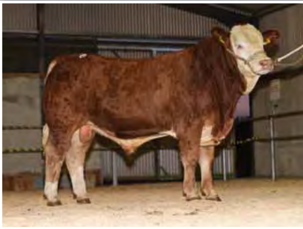
Leeherd Kansas €2650