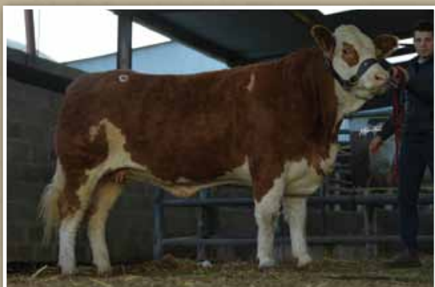
Clonagh Java Klassic Girl €5000