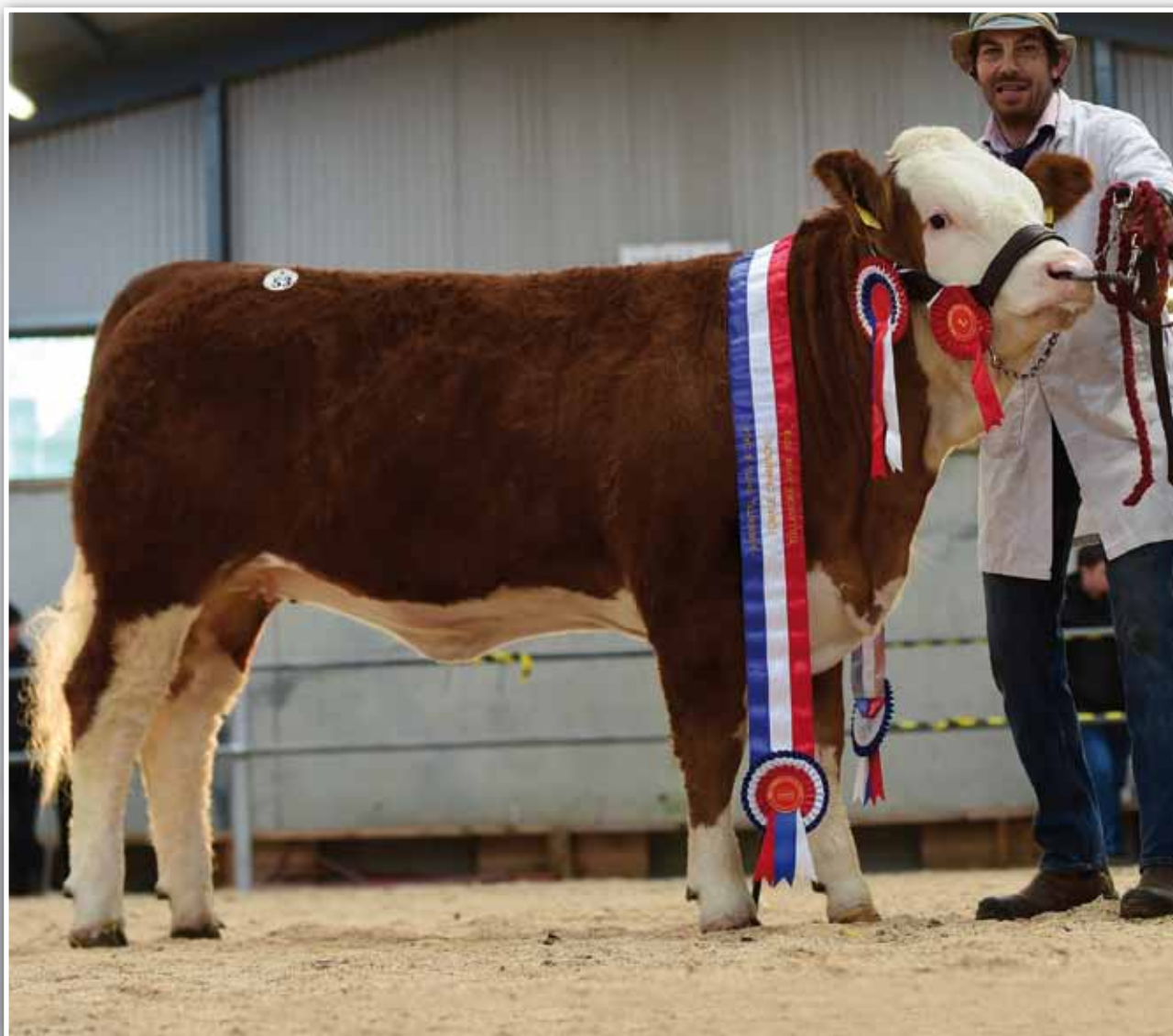
The Female Champion Clonagh Kitty Trixie €2000

The top of Garreth Behan's outfit was the first prize-winner Clonagh Jungle Class. This October 2017 born bull is a son of former herd stock bull Kilbride Farm Dragoon and the homebred Clonagh extra Fabulous. Weighing in at over 1,000kg the five star terminal bull met his reserve and sold for €3,000 to an Italian buyer. As mentioned this was one of five lots secured by overseas buyers on the night, with Clonagh King Of The Jungle also getting the boat selling for €2,800. This bull was the youngest animal catalogue and another son of Kilbride Farm Dragoon. Dam behind the stylish young bull is twice overall Simmental of the year Clonagh Dora the Explorer.