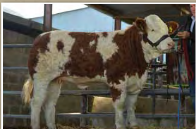
Lissadell Kirstie €9000