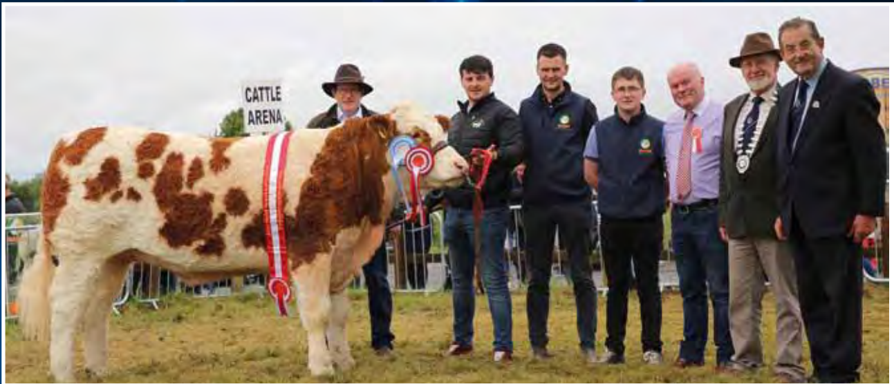
Lissadell Just The One the Interbreed Pedigree Suckler Heifer Champion at Claremorris Show.