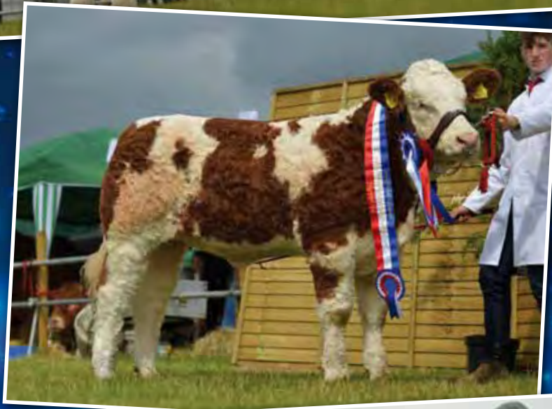
Reserve Junior Female and NATIONAL Weanling Heifer Champion Lissadell Kirstie ET.