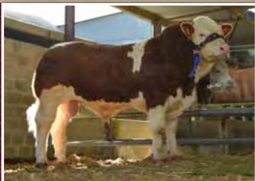
Broomfield King Lad €3600

In summary the heifers achieved an 82% clearance with an average price of €3673 which was up €986 on the corresponding sale last year.