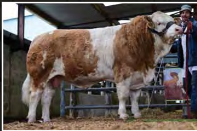
Clonagh Jameson €2700