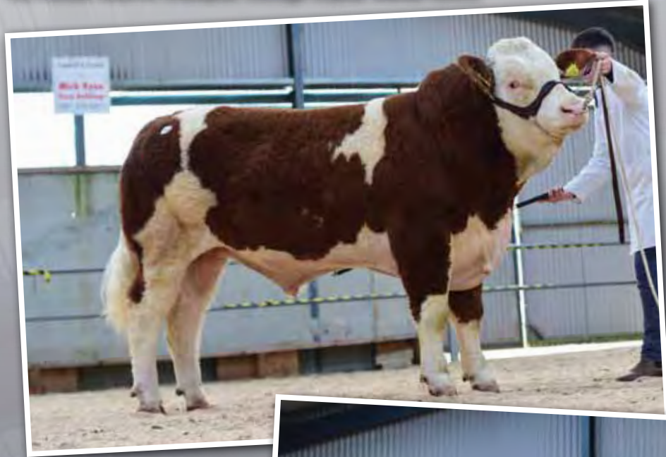
Ardunsaghan Kaiser €2200