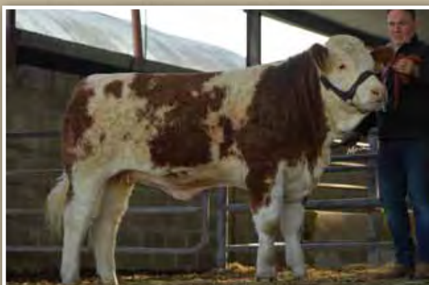
Lissadell Klassic Girl €6500