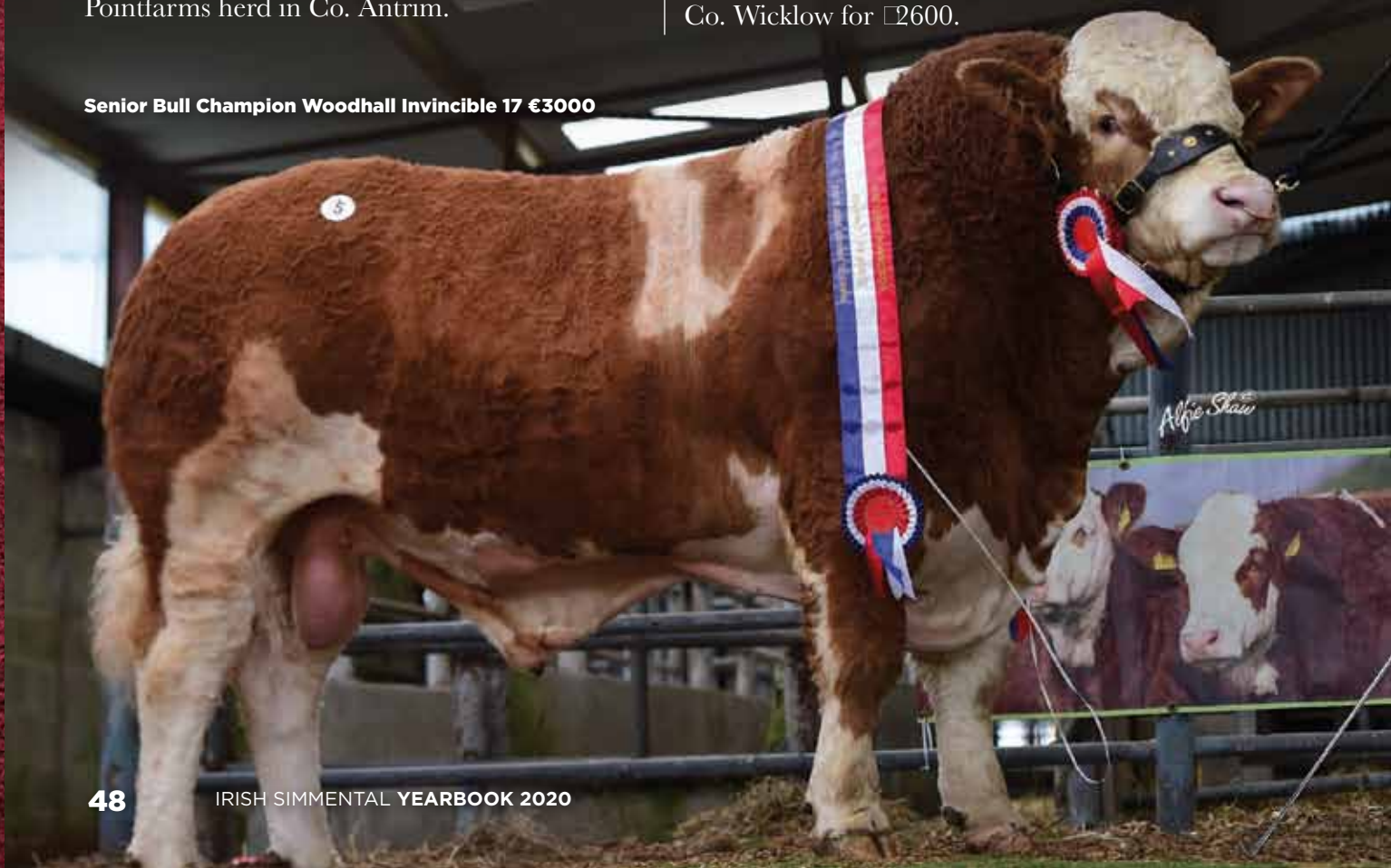
Senior Bull Champion Woodhall Invincible 17 €3000