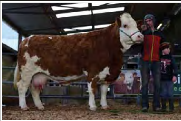
Corbally Vintage Katie ET €5900