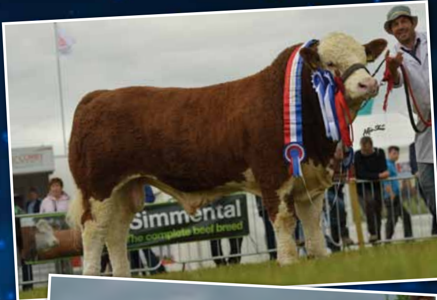
Reserve Overall Male, Reserve Senior Male and NATIONAL junior Bull Champion Clonagh Kaboom Kid.