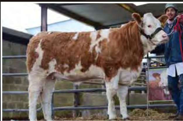
Clonagh Jilly Fiona €2500