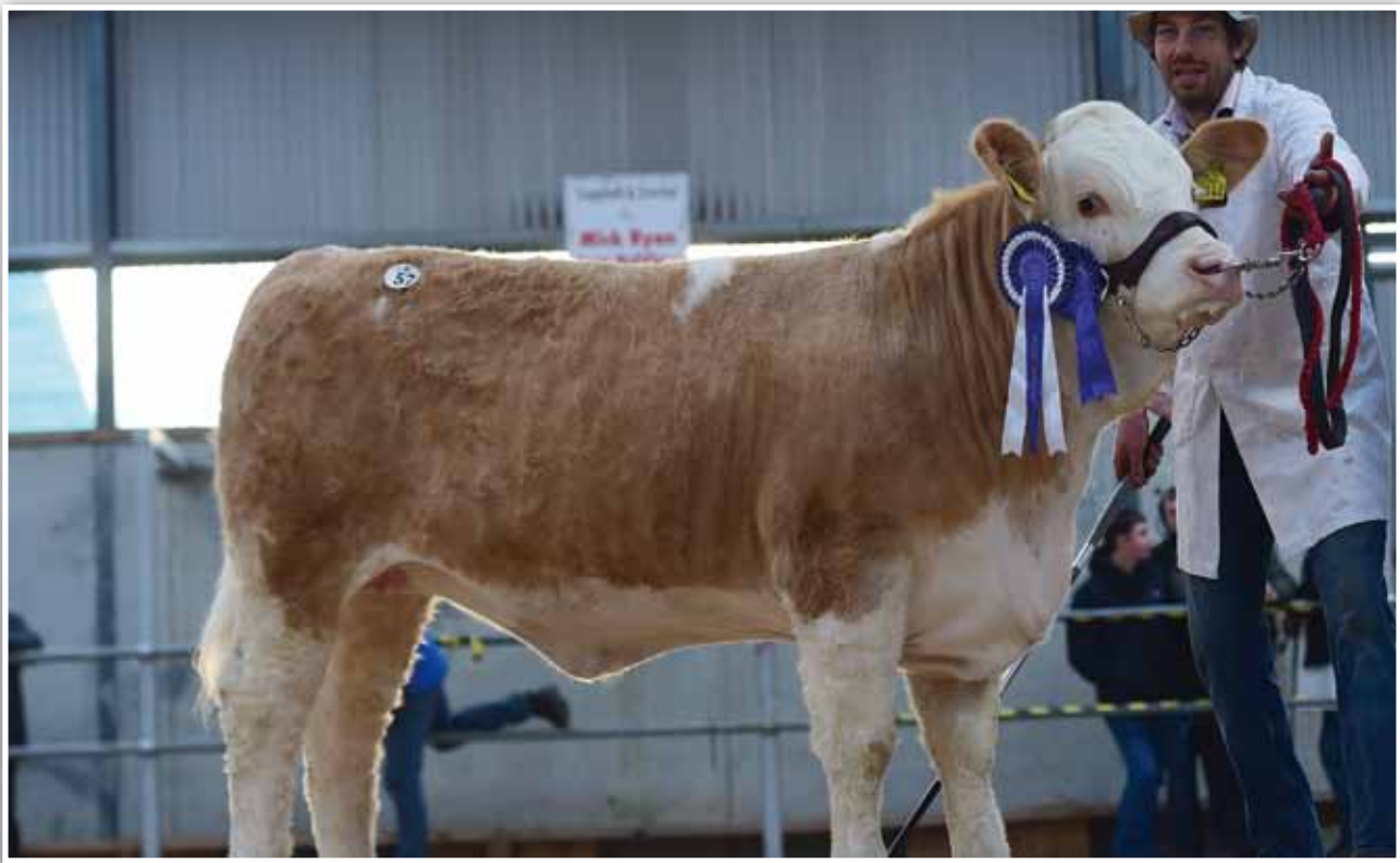
The Female Reserve Champion Clonagh Krystal Wanda €2000