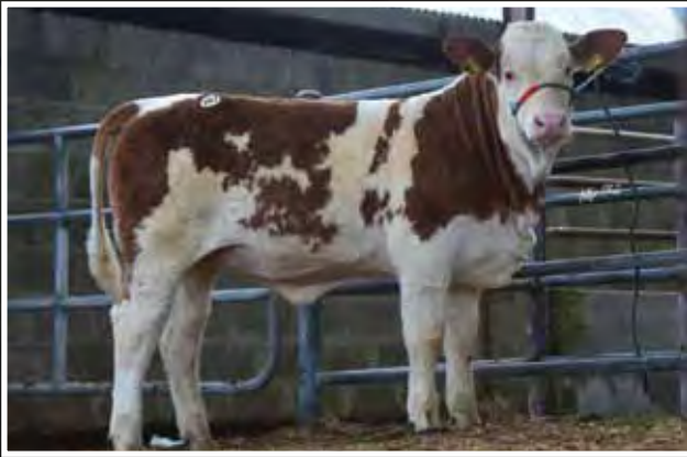
Corbally Kerrys VIP €3000