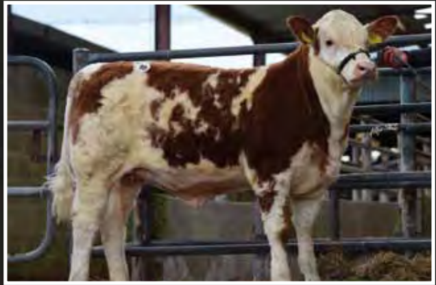
Corbally Klassic VK ET €3000