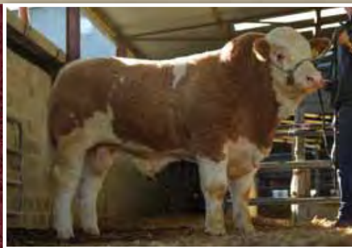
Dermotstown King Kong €3100