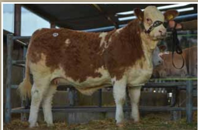
Clonagh Kissy Eyes ET €5000