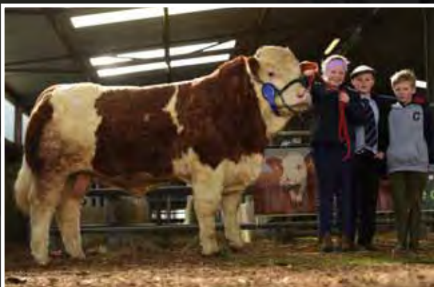
Moorglen Kool Dude €2700