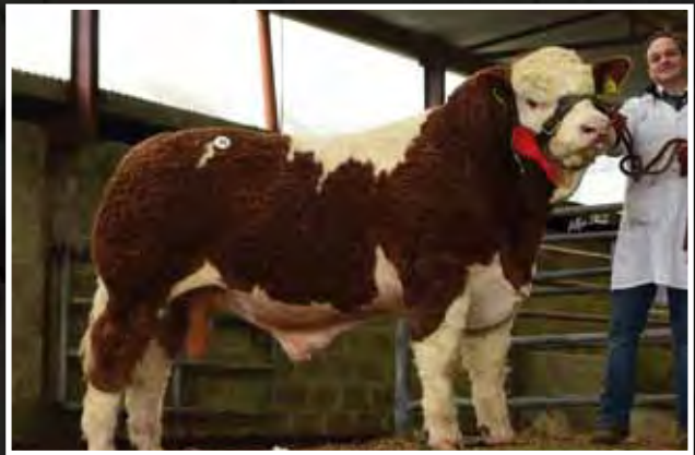
Fearna Jackpot ET €4300