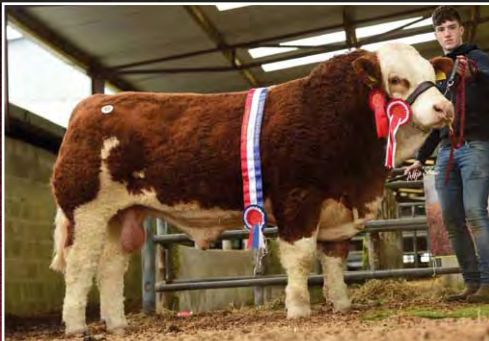
Junior Bull Champion Lissadell King VIP €4000