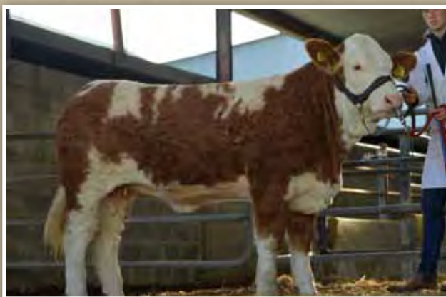
Lissadell Karoline €5100