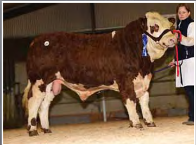
Towerhill Knockout Kid €3100