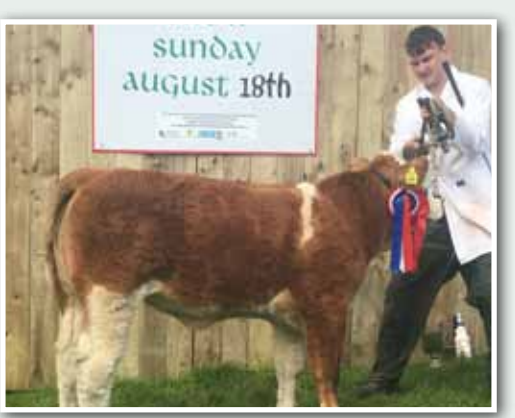
Fohera Little Cracker the Champion at Mohill Show.