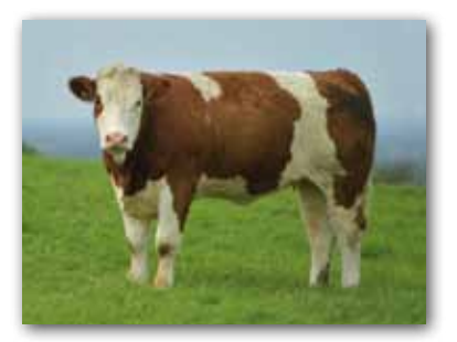
Lochview Kandy €7000