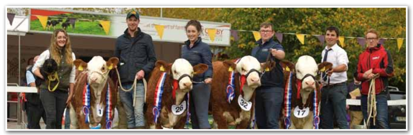
The Rathnashan Team pictured at Strokestown after they won four out of the five National Calf Titles judged on the day.