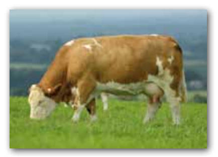
Raceview Favourite ET €7200