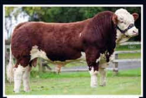
Kilbride Farm DRAGOON

To order semen or for advice on sire selection please contact Garrett 086 8167309