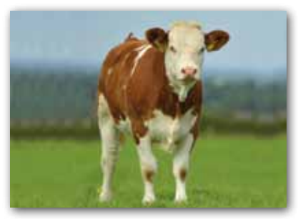
Hillcrest Laura €3300