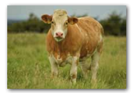
Hillcrest Jackie €4100