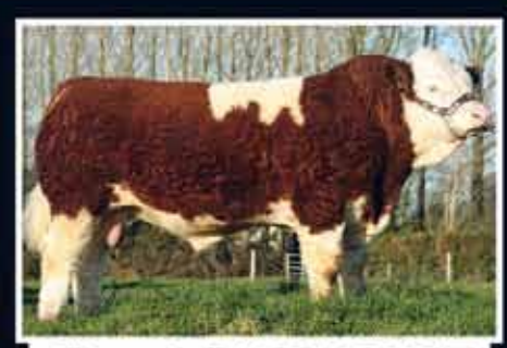
Clonagh DIRECT DEBIT

Overall Male of the Year 2018 - Proven for heifers