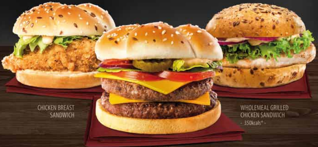
CHICKEN BREAST SANDWICH

100% PRIME IRISH BEEF & IRISH CHICKEN BREAST