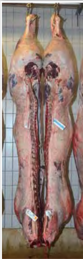
417 Kg Carcase at 14 Months Grade U+3-