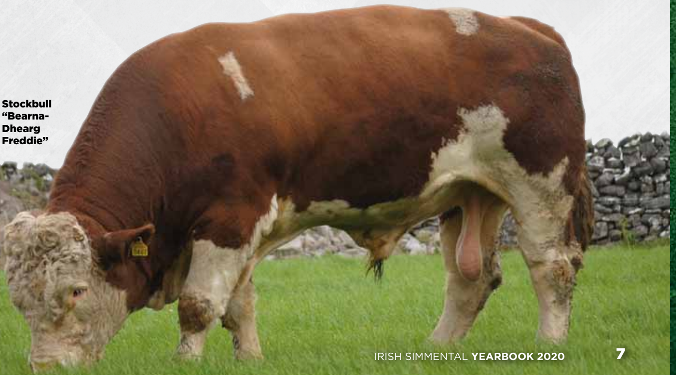
Stockbull "Bearna- Dhearg Freddie"

nationally for these traits having an average replacement index of €116 up from €87 in 2014. The herd also had an incredible 1.12 calves per cow in 2018, with an average calving interval of 366 days. A number of cows were presented on the day to highlight the herd's efficiency. In fact one of the cows focused on had reared 8 calves in 5 years with a calving interval of 381 days.